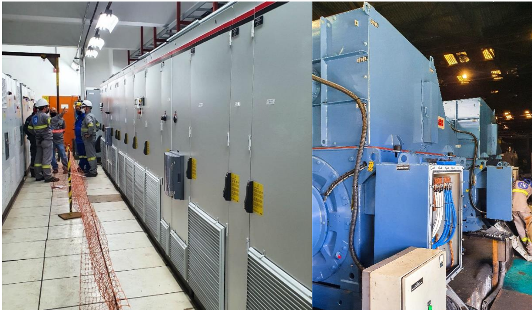
Figure 1 & 2 – Main parts involved in Cosigua intervention.

The supply scope expanded the availability of spare parts while also providing engineering and training.